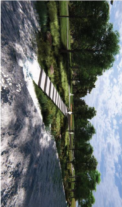
Stepped Canoe/Kayak Launch - Ordinary Water Level