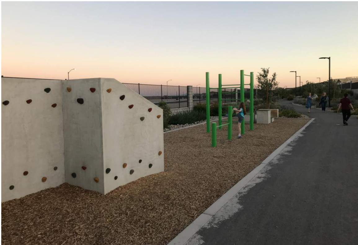
Progressive Playground Pic 2