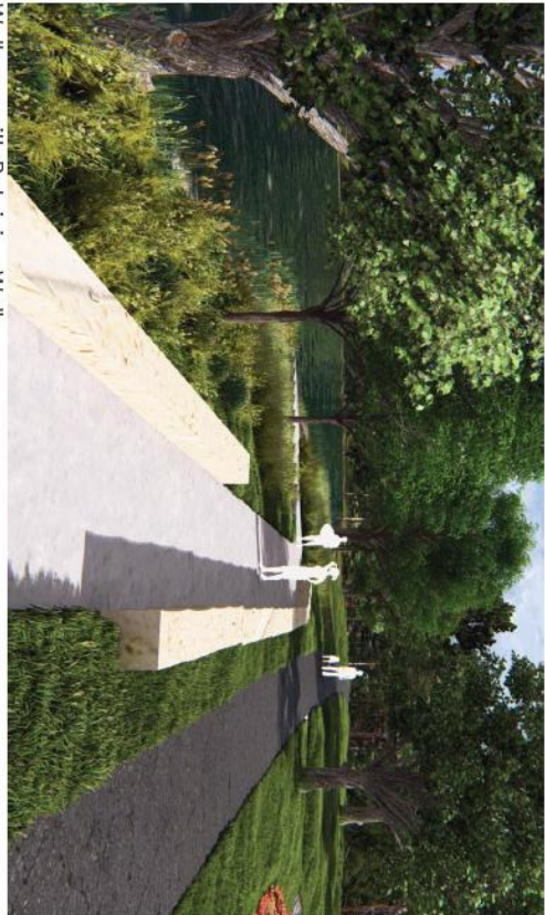
Walkway with Retaining Walls