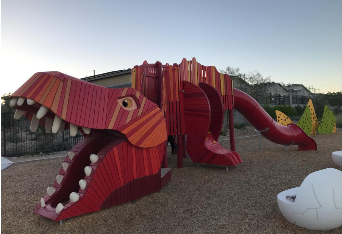
Progressive Playground Pic 1