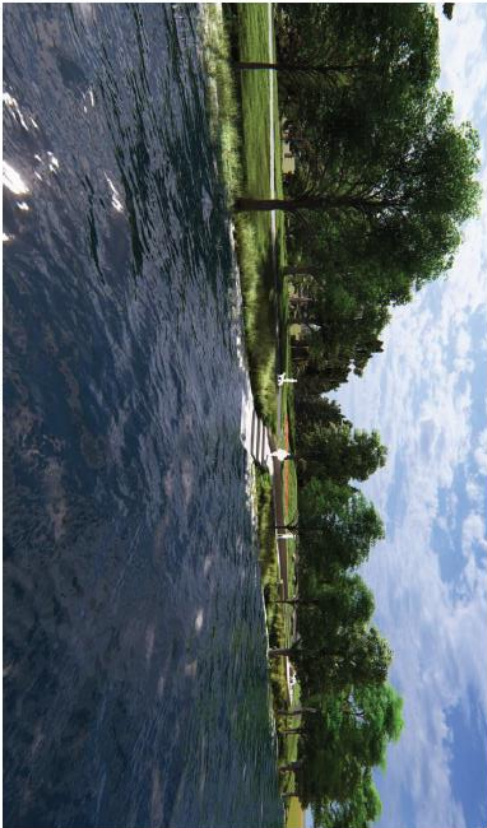
Stepped Canoe/Kayak Launch - High Water Level