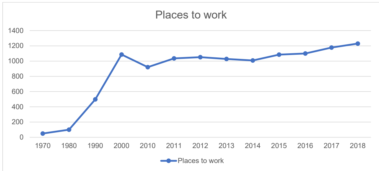
Figure 2.3. Employment in Dayton Historical Trends

Source: Metropolitan Council, Community Profiles and Annual Population Estimate